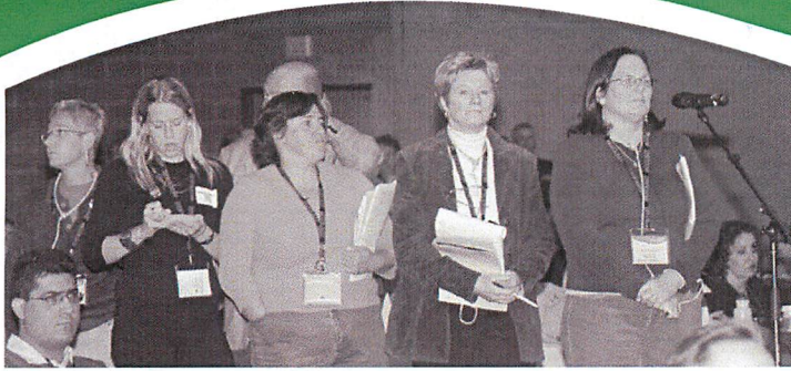
Delegates were keen to debate strategic directions.

This bulletin is published daily by CUPE Communications and distributed on the convention floor each morning.